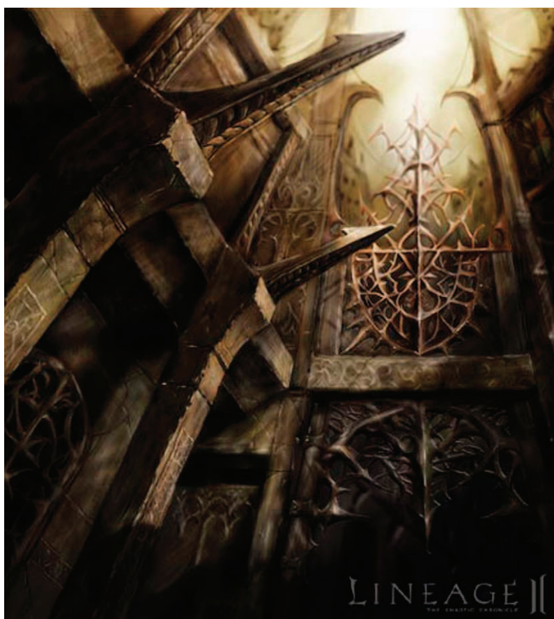
Figure 4 Inside virtual architecture of Cruma Tower in Lineage II illustrating the visual formality of an in-game area known for its irreverent parlance

Thus, while the visual form of MMO environments does not fit Oldenburg’s (1999) criterion of “low profile,” the social function of those environments does.