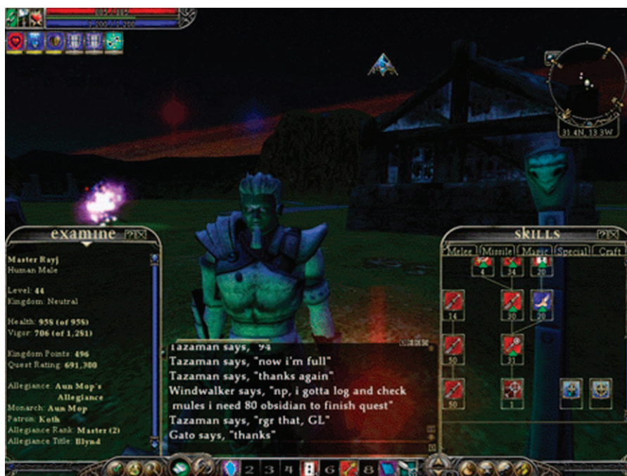
Figure 3 Screenshot from Asheron's Call II that shows two players standing outside of town center exchanging healing “buffs” (beneficial spells cast on oneself or other people’s avatars) and thanks you’s

However, not all in-game territories are alike in these terms. If Oldenburg is correct and plainness is indeed crucial to deter pretension, it would follow that any