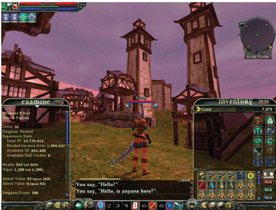
Figure 6 Screenshot from Asheron's Call II showing a deserted town center in what is supposed to be a busy city

diverse worldviews found themselves interacting on a level playing field. For example, during the 2004 U.S. presidential election period, supporters of both presidential candidates cussed and discussed the televised debates while slaying monsters in game. This mixing extended to game play issues as well. In some cases, teenagers mentored adults twice their age and education in how to level their avatar, find the best territories for hunting, or lead a guild. However, while such bridging was frequent, it was more likely to lead to potential resources or new information within the longer-term groups such as “guilds” than within the temporary “pick up” groups that band together for short-term goals. Within the guild organizations in particular, players were able to establish enough of a relationship to exchange real-life information beyond the basic “a/s/l” (“age, sex, and location”) to include a greater diversity of viewpoints and experiences.